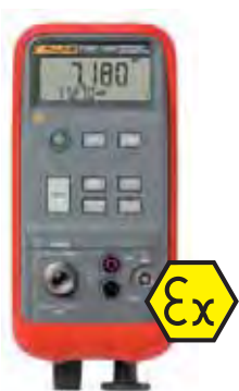
Fluke 718Ex See page 122